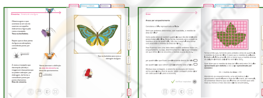
Figure 2: When the learner touches the butterfly an animation shows its symmetry axe.

Contiguity Principle. An explanation containing words and pictures is better understood when they are presented at the same time. Since corresponding words and pictures are in the working memory at the same time, schema formation may take place, (Mayer, 1997). In the TextMat book several explanations contain simultaneously text and (animated) pictures, (Clark, 2003).